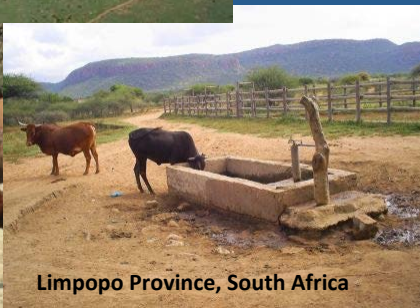
Limpopo Province, South Africa