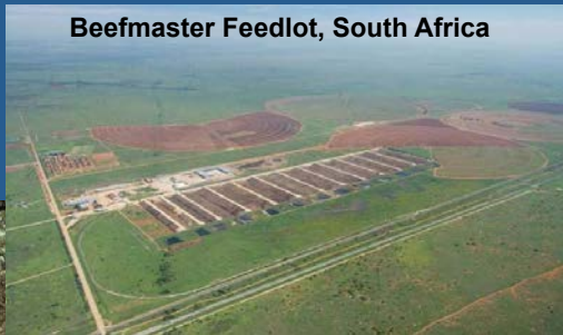
Beefmaster Feedlot, South Africa