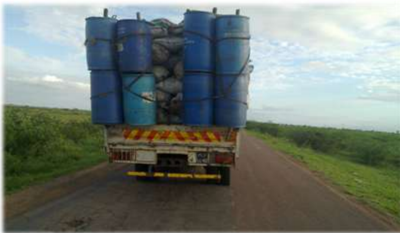
Massingir /Maputo charcoal Truck 11/2010

Revenues from employment in South Africa