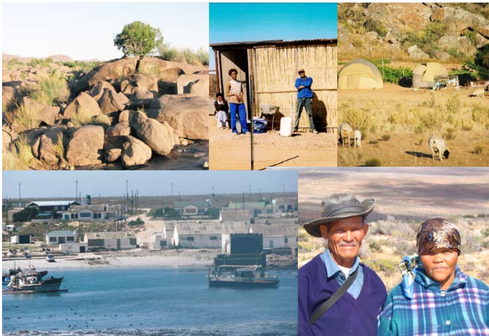
The COWEP Communities