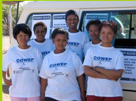
Youth Volunteers AUGRABIES